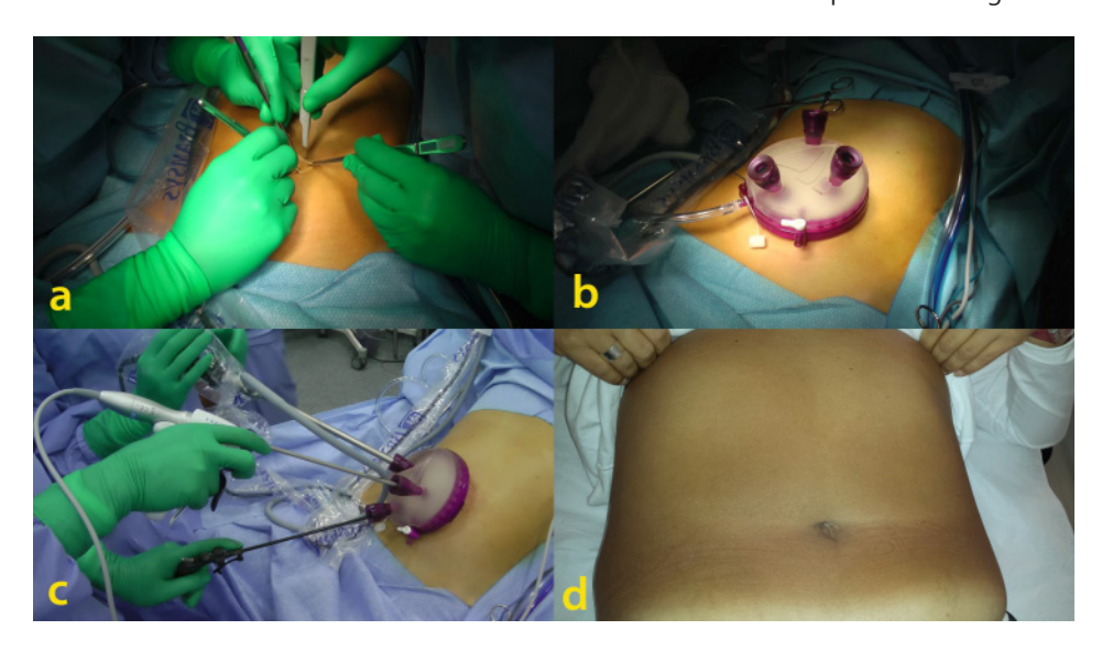
FIGURE 1 - Single-port platform set-up: a) umbilical incision is performed; b) gelatin cap is attached to the platform with three working (5 to 12 mm) ports; c) the single-port is able to accommodate at the same time three instruments with no triangulation prejudice; d) final view of umbilical wound nine months after the procedure.

This procedure was used in a 47-year-old woman with a 4.2 cm retroperitoneal cystic lesion found by routine ultrasonography. Endosonography<sup>6</sup>, MIR, CT and biopsy findings were consistent with pancreatic mucinous cystadenoma (Figure 2a). The initial plan was to perform a single-port distal pancreatectomy with splenic preservation. Intraoperative ultrasound (SonoSite, Inc., Bothell, WA, USA) indicated that the tumor was not from pancreatic origin. Absence of cleavage